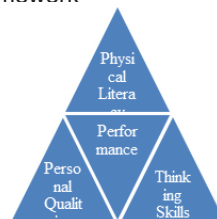
Figure 1: The Learning Framework