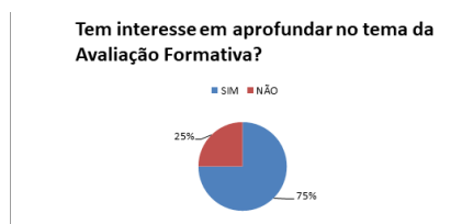
Graph 1 - Interest of the teachers of the State School "Do Lajão" in deepening in the subject Formative Evaluation.

And as a third step, the interview was delivered, which consisted of discursive questions that should be answered by each teacher according to his or her evaluative practice in the classroom.