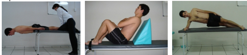
Figure 2: Testing of specific lumbar-pelvic stability, respectively: Resistance in the trunk extension, flexion strength in the trunk and Resistance in bridge side.

Test: the pelvis is high of the table as high as possible forming a line of linear foot to the head. Statically the athlete keeps high for as long as possible.