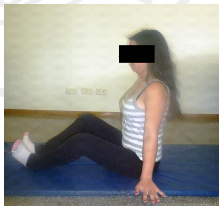
Figure 2. Representation of the posture "sitting center" method RPG.

The subjects were assessed prior to the posture immediately after and within 24 hours, and all reviews occurred in the afternoon. The variables analyzed were muscle strength and extensibility of the lumbar spine.